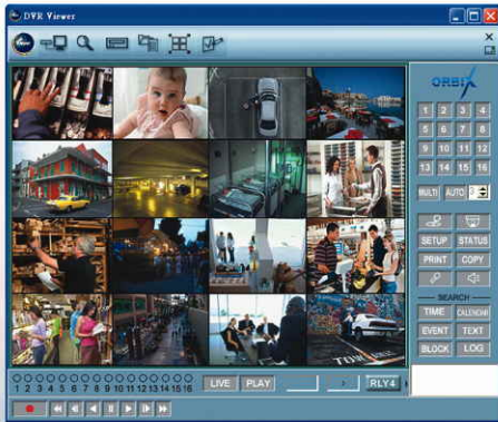
Orbix Software Client Interface

The advanced standalone Orbix H264 security DVRs incorporate an embedded operating system with on-screen display (OSD) menu, audio and alarm inputs, and stores video using the latest H264 compression code/decode (codec) format. It has a user selectable image capture rate and video resolution and can hold up to three internal disk drives (SATA interface). A built-in web server allows remote internet viewing using MS Internet Explorer 5.0 or greater. Free down-loadable software allows programming and advanced DVR control during remote viewing using the Orbix client interface.